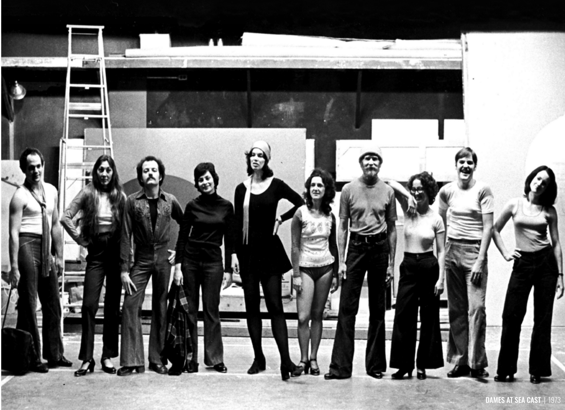
DAMES AT SEA CAST | 1973

The beloved converted library building at 888 Morro Street is bursting at the seams.